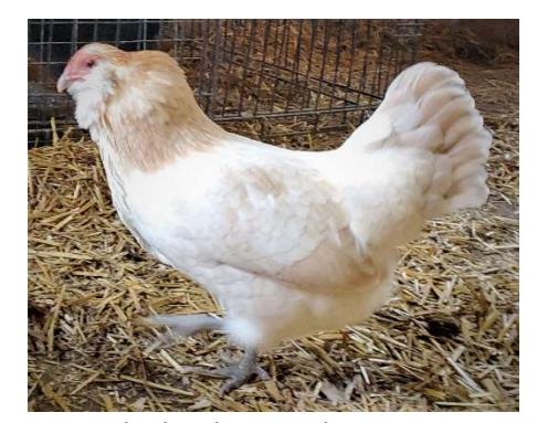
Splash wheaten bantam Ameraucana hen