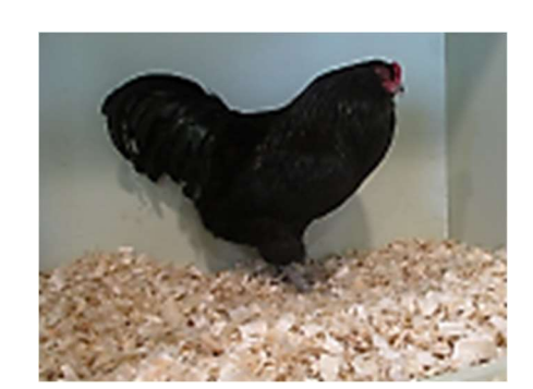
Jim Fegan's black cock